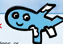
Itami City Mascot Hikomaru