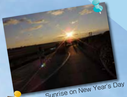
Sunrise on New Year's Day