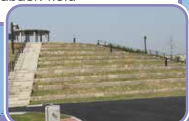
Dandan-Terrace (stone steps)