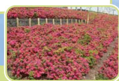
Azalea covered slope